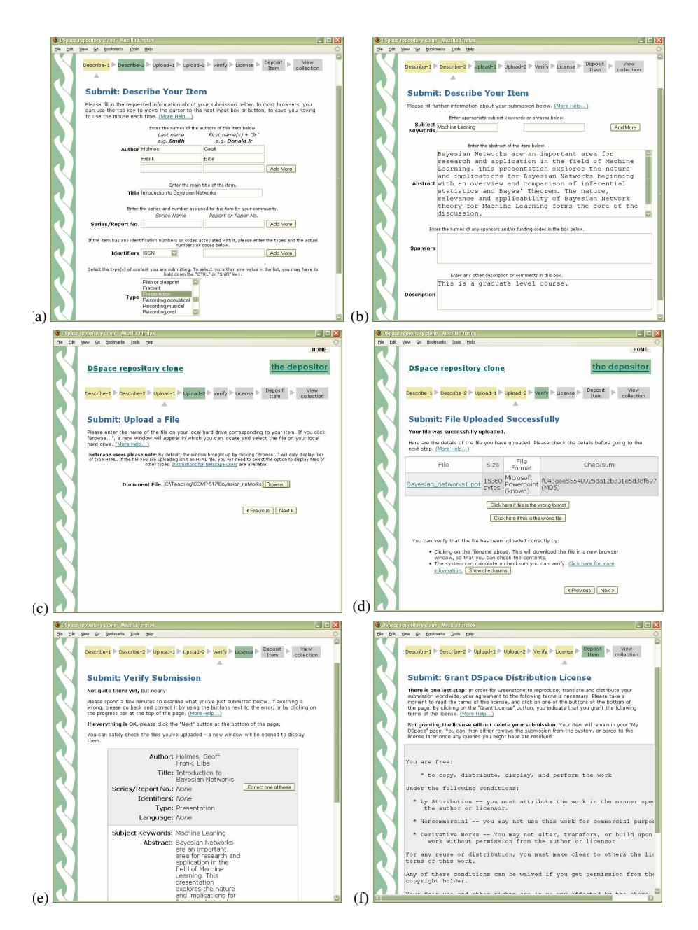
Fig. 4. Emulating the submission workflow for DSpace (a) primary metadata (b) secondary metadata (c) select file (d) check file (e) review metadata (f) choose license